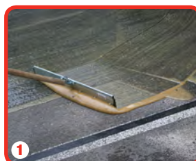
1 Area is cleared of debris and marked with tape before resin and hardener mix is spread over it