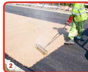
2 High friction surface is spread evenly and levelled