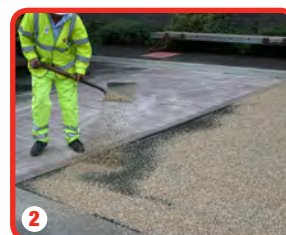
2 Appropriate aggregate is broadcast over the resin mix