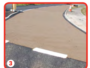
3 After resin mix has set, excess aggregate is brushed off before tape is removed leaving clean, straight finish