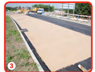
3 Surface is complete and can be ready for traffic in under an hour