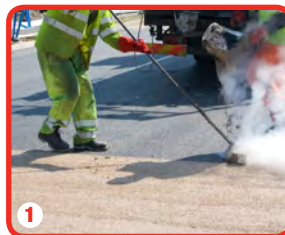
1 Area is cleared of debris before product is applied with a screed box